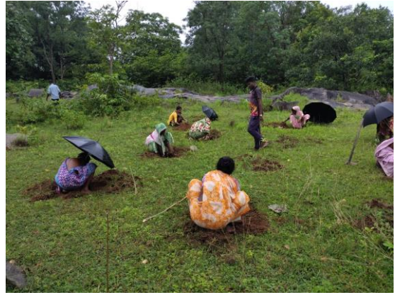
Waste Land Development Programme

To needs an integrated approach consisting of all aspects like land, water and forest development for increasing fertility and output without disturbing the organic link and the biodiversity. The organization is working in followings programmes of its operational area.